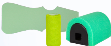
Sterile Patient Protective Pad Set. Latex-free