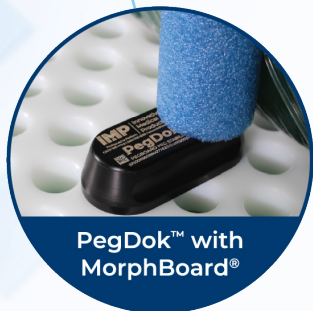
PegDok™ with MorphBoard®

Center board can be rotated vertically or horizontally to better accommodate patients.