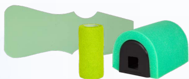
Sterile Patient Protective Pad Set. Latex-free