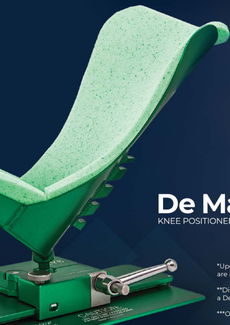
De Mayo D2® KNEE POSITIONER